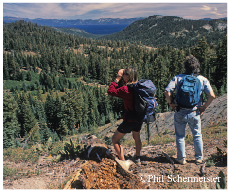
A couple survey Barker Pass on the Pacific Crest Trail in California.